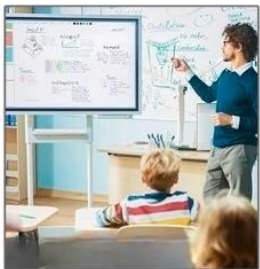
Teach in class