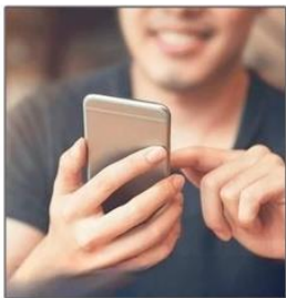
Mobile phone record