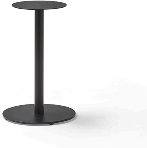
TABLE BASE REF.: 78254