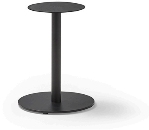
TABLE BASE REF.: 78253