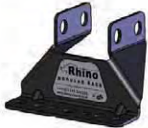
(MS176) x 4