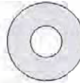
M8 (FW016) x 28