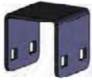
(MS161) x 4